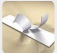
Easy-to-peel split backing

inserts or other applications where adhesive is not required